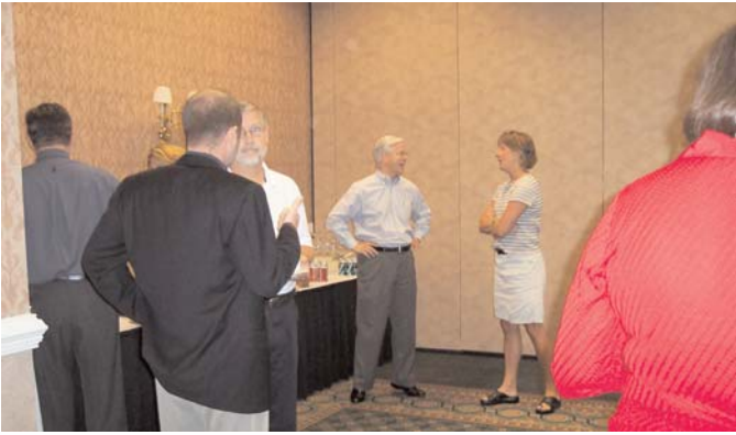
Training participants took a break from learning risk communication skills.