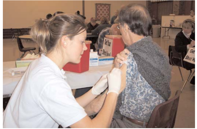
The limited flu vaccine was provided to nearly 3,000 high risk county residents in 2004.

The McLean County Health Department was selected as a new agency to receive gifts from the Giving Tree. As a result, especially needy families enrolled in the department's Family Case Management program received holiday gifts from many generous State Farm Insurance Companies® employees.